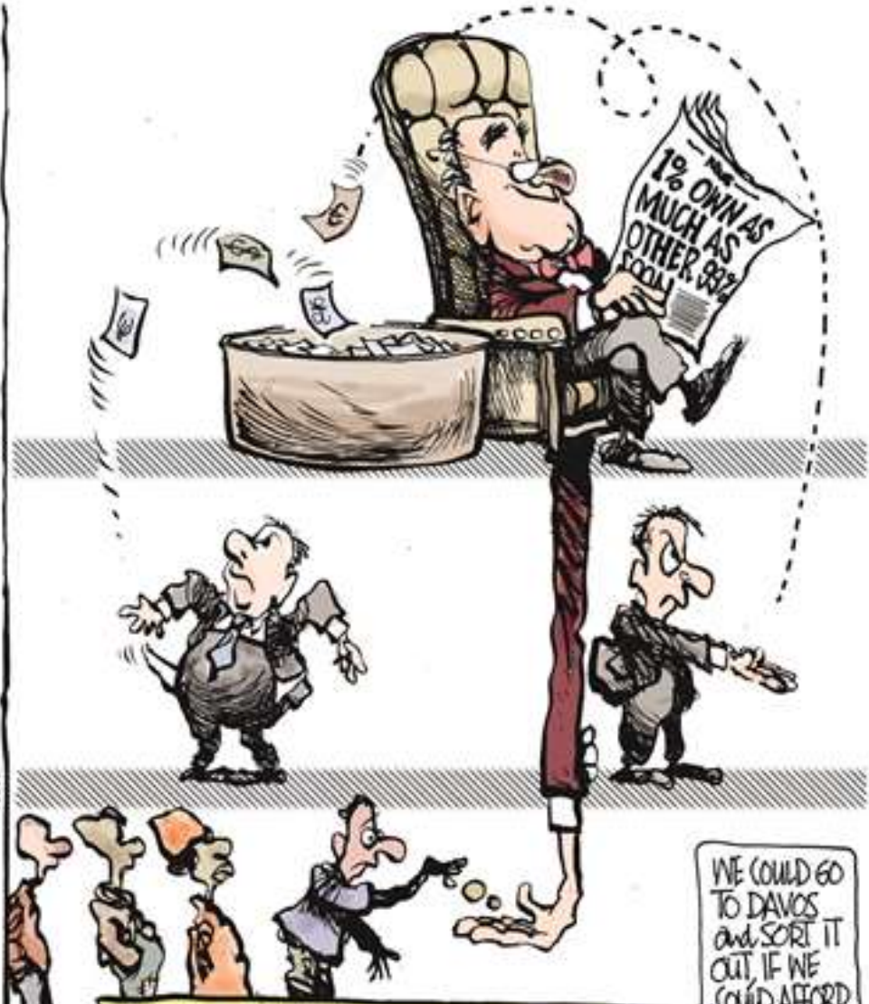
...TRICKLE UP PRACTICE