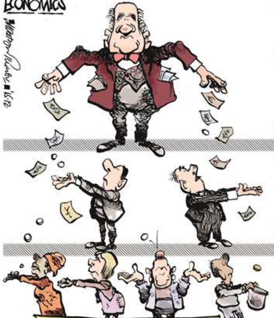
TRICKLE DOWN THEORY...